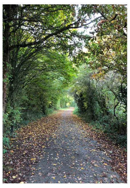
Tree tunnel in the Woodland Park